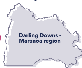
Darling Downs - Maranoa region