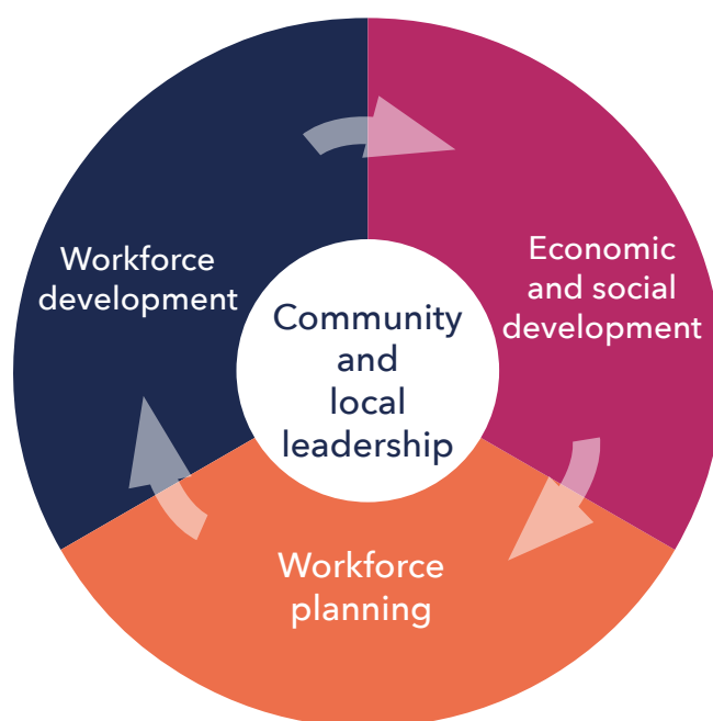
Figure 1. Workforce planning and development is a key driver of economic and social development

From a region's perspective, workforce planning identifies the required skills to help ensure businesses have ongoing access to a skilled labour force.